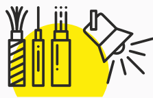
Led Lighting Solutions, Electrical Cables, Switch Boards & Wiring Accessories