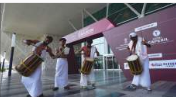
Welcome In Traditional Way