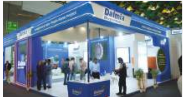
Dalmia Cement (Bharat) Limited