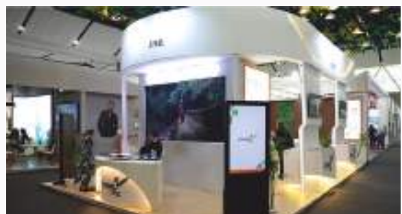
Jindal Steel & Power Ltd