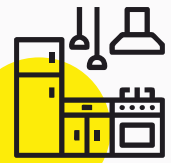
Electronic Appliances & HVAC