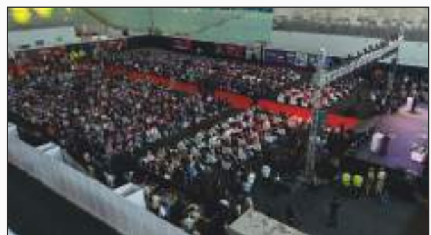
The Participants During Inauguration Ceremony