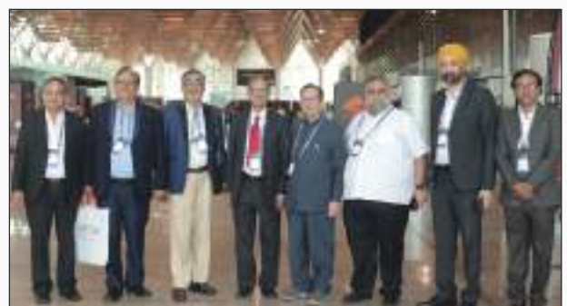
Vibrant Buildcon with Capexil

(Hon'ble Former Minister of State for Agriculture and Farmers Welfare of India)