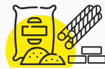
Cement, Steel & Lightweight Construction Blocks (AAC)