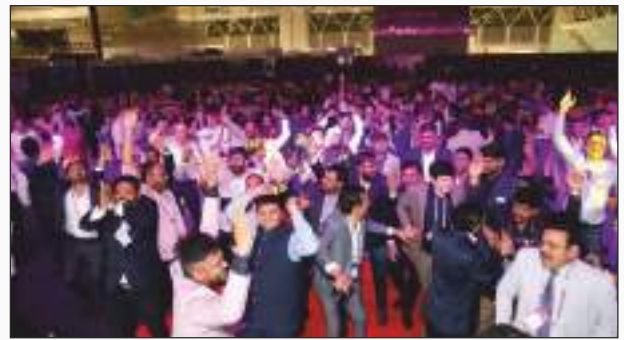
Gala Vibes And Good Times.