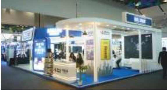
Shree Cement Limited