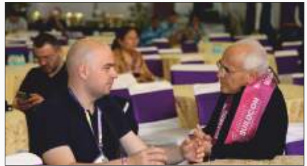
Networking at Gala Dinner