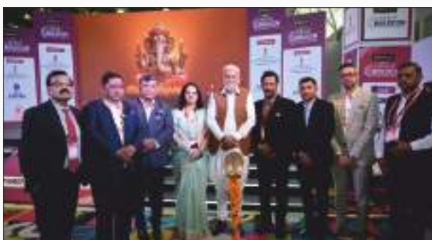
Shri Parshottam Rupala

(Commerce Secretary, Ministry of Commerce, Government of India)