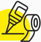
Glue, Tile Adhesives, Grouts & Construction Chemicals