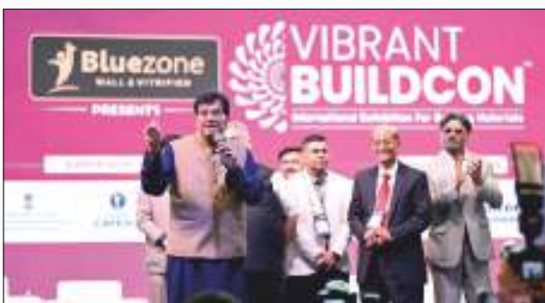
Shri Piyush Goyal Addressing Vibrant Buildcon's Success