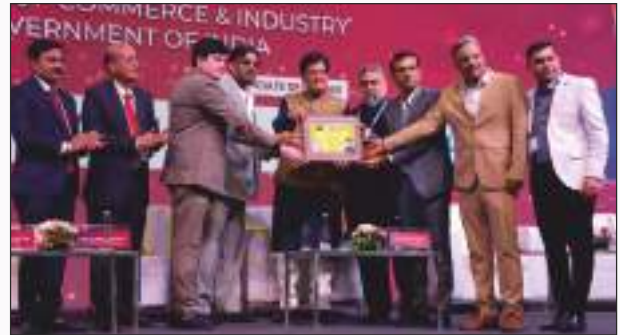
Honoring Shri Piyush Goyal With Memento