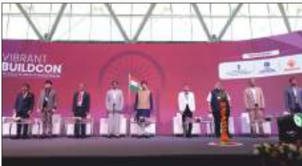
Dignitaries on Stage