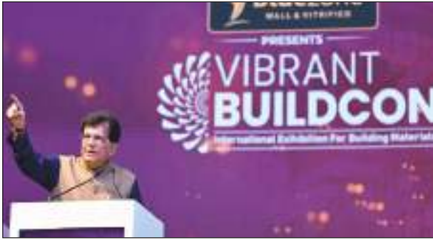
Shri Piyush Goyal ( Minister of Commerce and Industry, Government of India )