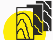
Timber, Plywood, Laminates & Flooring