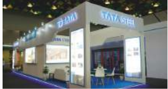
Tata Steel Limited