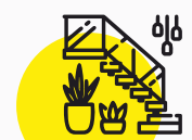
Interior Décor, Wall Panels & Exterior Cladding Solutions