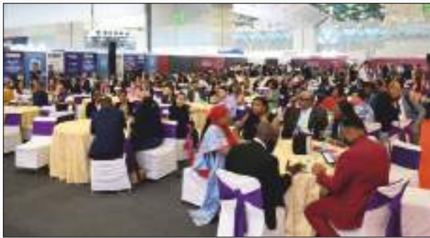
A Joyful Gathering Over A Grand Gala Dinner