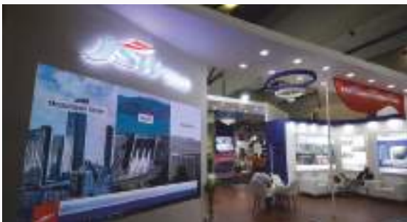
JSW Steel Limited