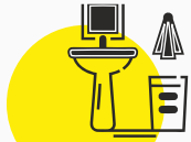
Hardware, Bathroom Fittings & Sinks