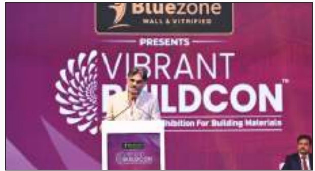
Mr. Suniel Shetty ( Actor & Brand Ambassador of Vibrant Buildcon 2025 )