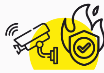
Fire Safety Systems, Surveillance & Access Control Solutions