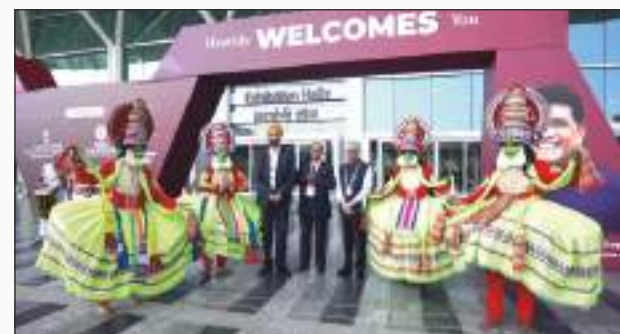
Welcome In Traditional Way