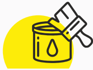
Decorative Paints, Wall Putty & Gypsum Board