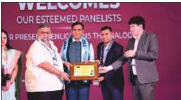
Shri Mansukh Mandaviya

(Hon'ble Minister of Youth Affairs and Sports and the Minister of Labour and Employment)