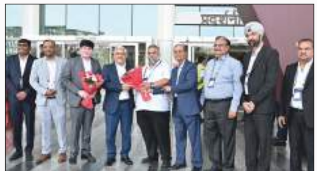
Shri Sunil Barthwal

(Hon'ble Minister of Youth Affairs and Sports and the Minister of Labour and Employment)