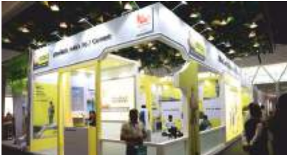
Ultratech Cement Limited