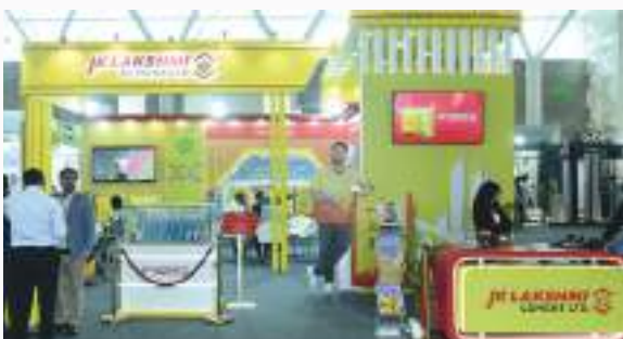
Jk Lakshmi Cement Limited