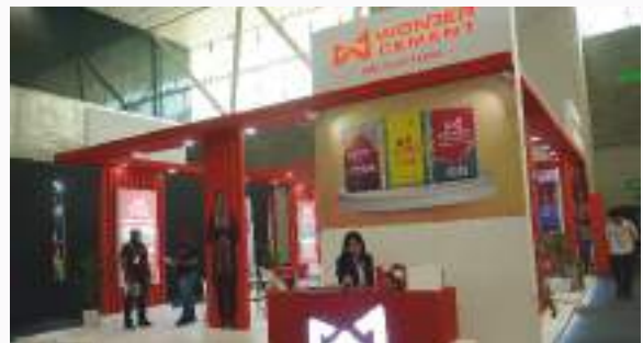
Wonder Cement Ltd